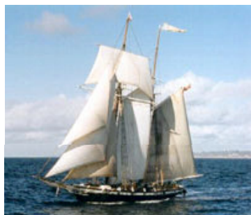
The Californian: California State Tall Ship

Along with the tall ships there will be several events taking place, including a Juried Art Exhibition, and an Octoberfest sponsored by the Chula Vista Yacht Club.